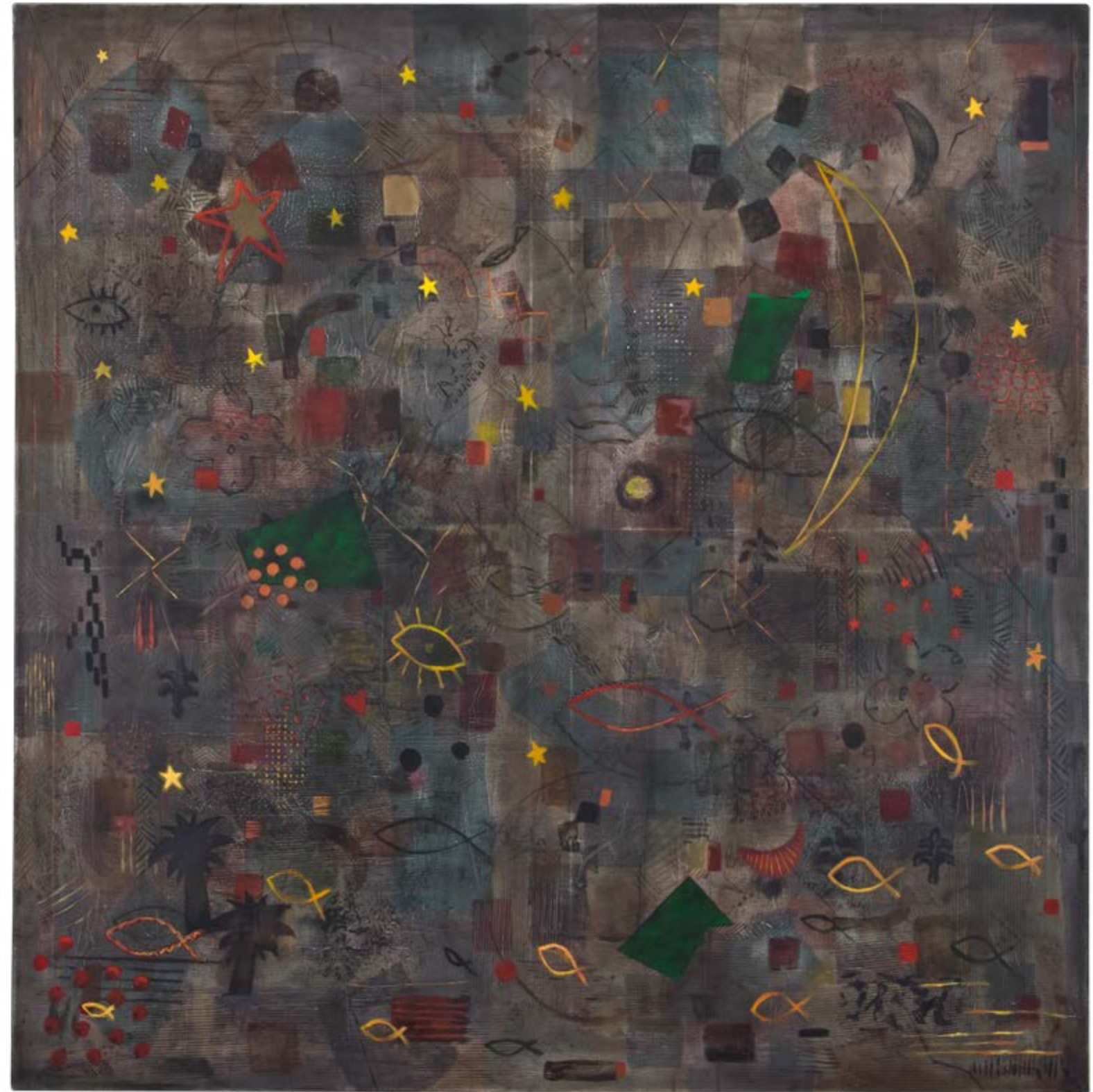
24. Mystic, mixed media | 118x118 cm | 2017