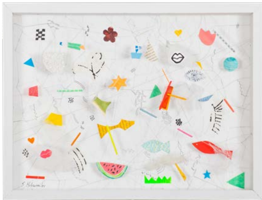
3. Summer box I, mixed media | 31x41 cm | 2017