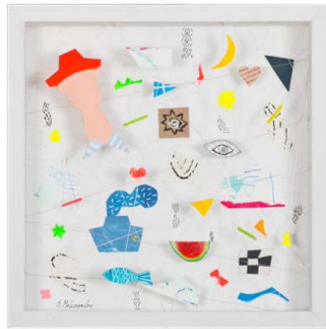
4. Summer box II, mixed media | 30x30 cm | 2017