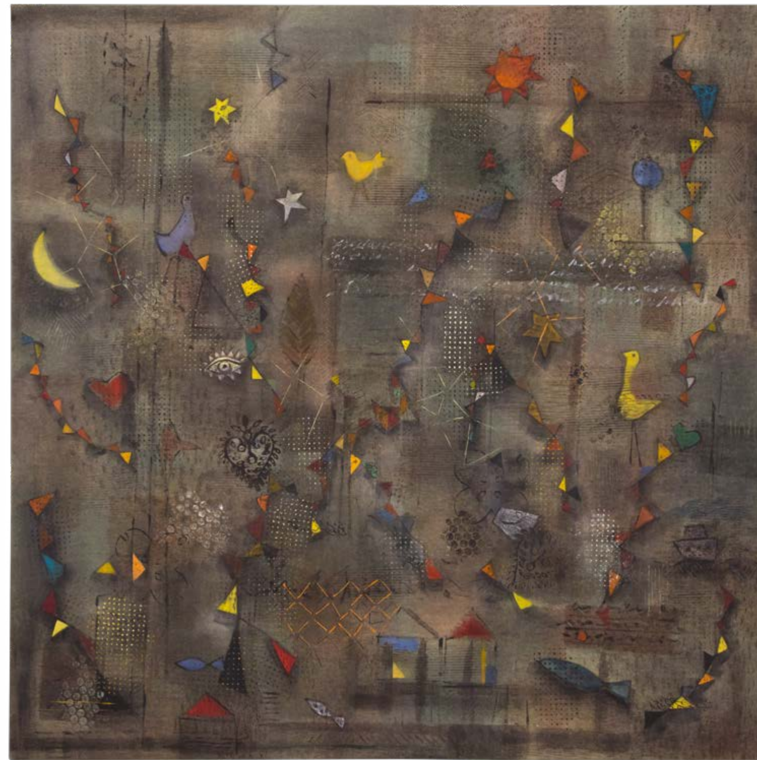
23. Fairy tale, mixed media | 100x100 cm | 2017