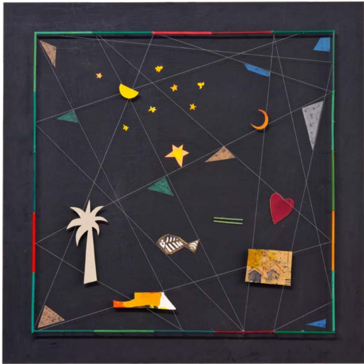
8. Oriental night, mixed media | 61x61 cm | 2018