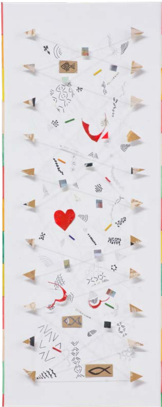
13. Match game I, mixed media | 60x24 cm | 2018