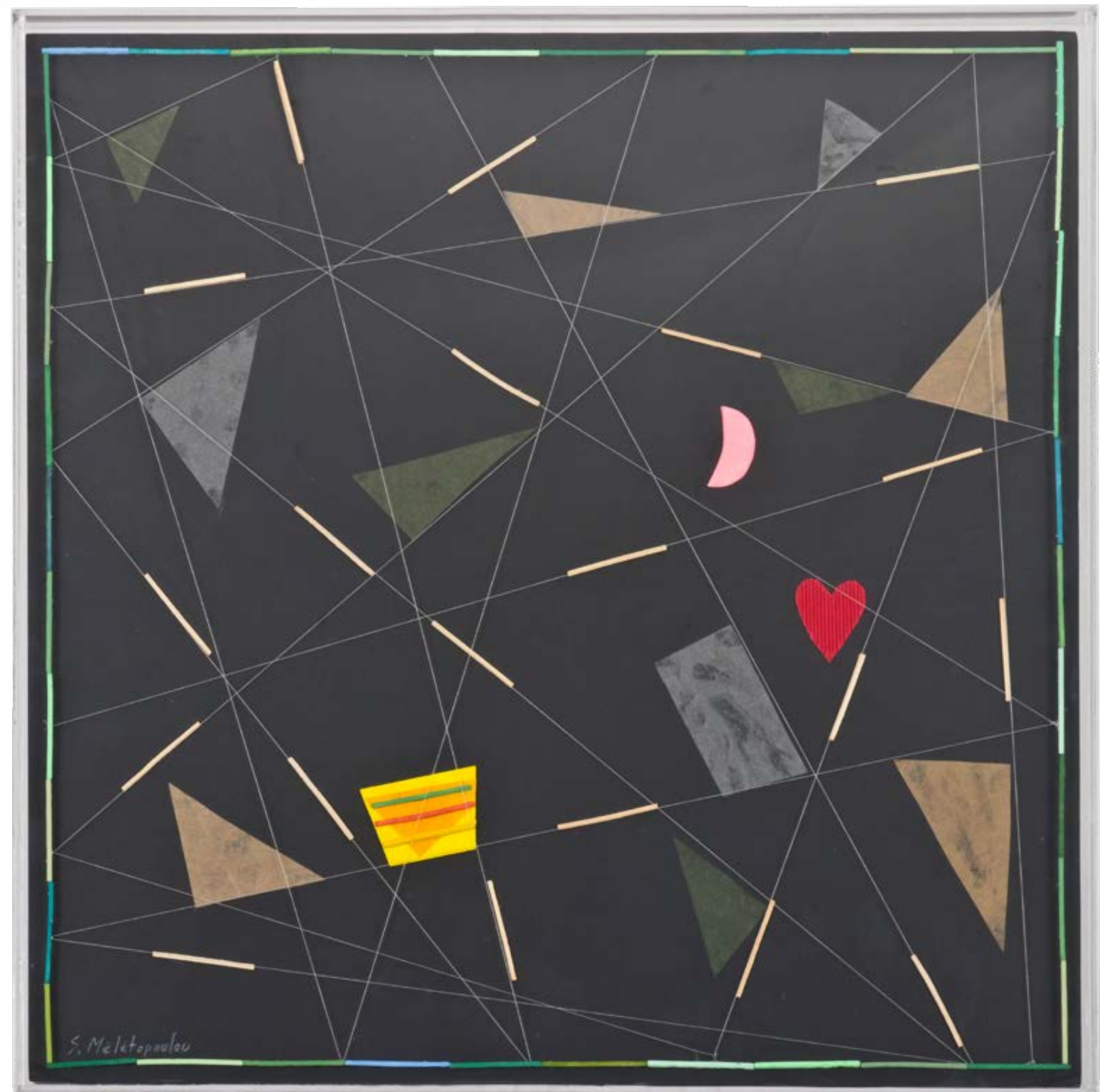
10. Nighttime, mixed media | 51x51 cm | 2016