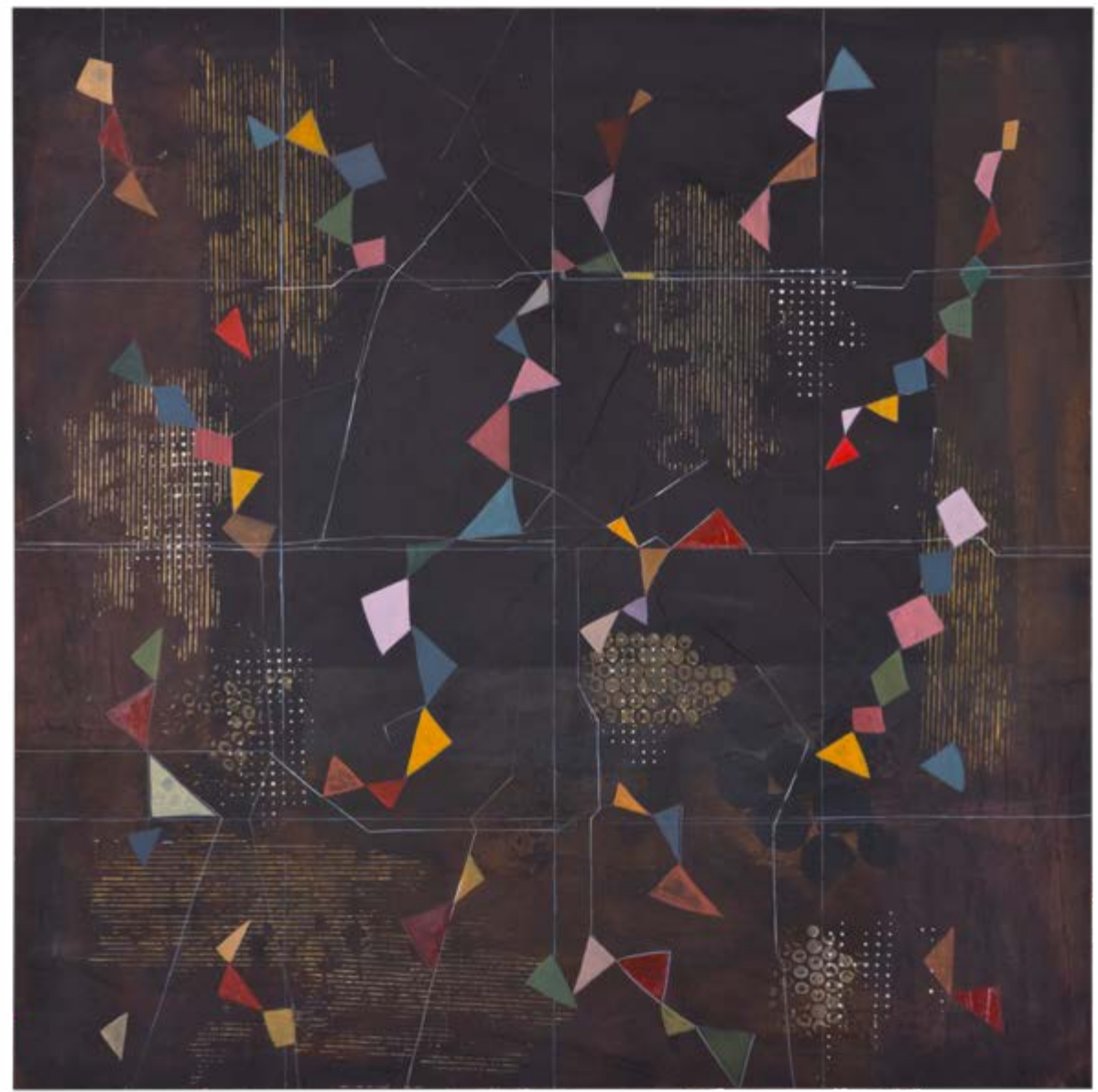
9. Night hues, mixed media | 70x70 cm | 2017