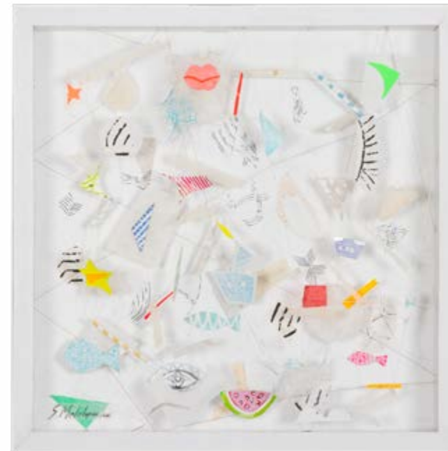
5. Summer box III, mixed media | 30x30 cm | 2017