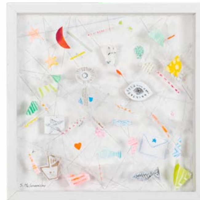
6. Summer box IV, mixed media | 30x30 cm | 2017