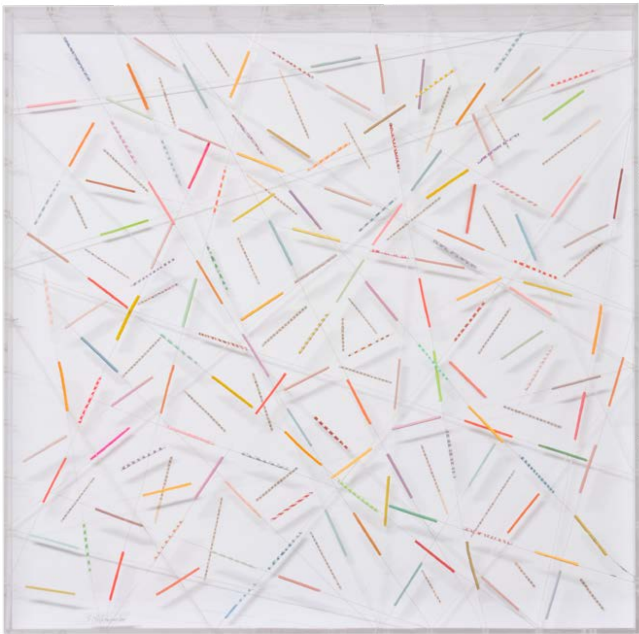
18. Mix and match I, mixed media | 60x60 cm | 2016