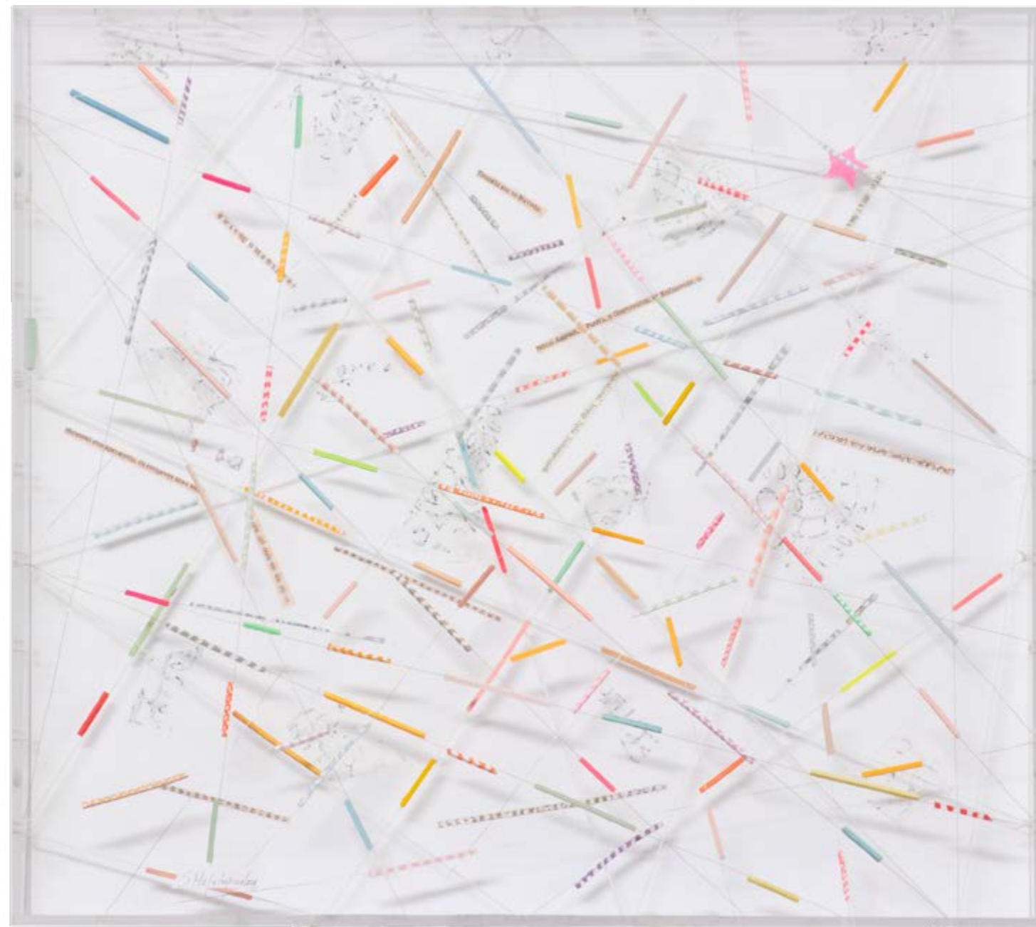
19. Mix and match II, mixed media | 40x50 cm | 2016