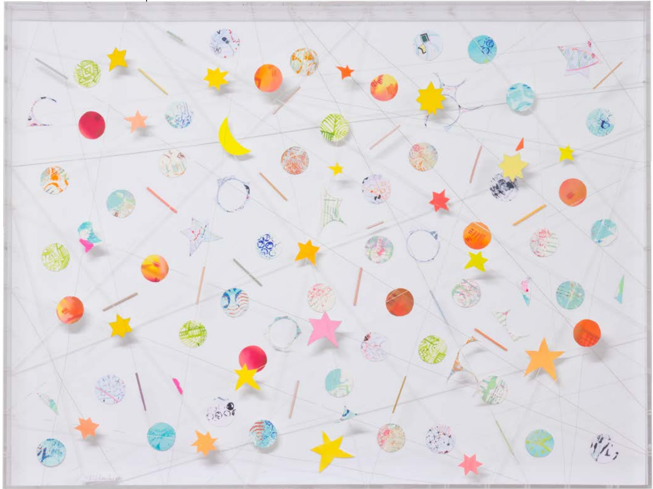
20. Space game, mixed media | 61x81 cm | 2016