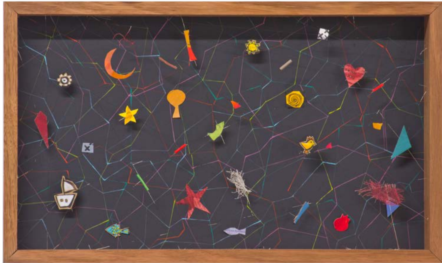
11. Toy box, mixed media | 30x50 cm | 2017