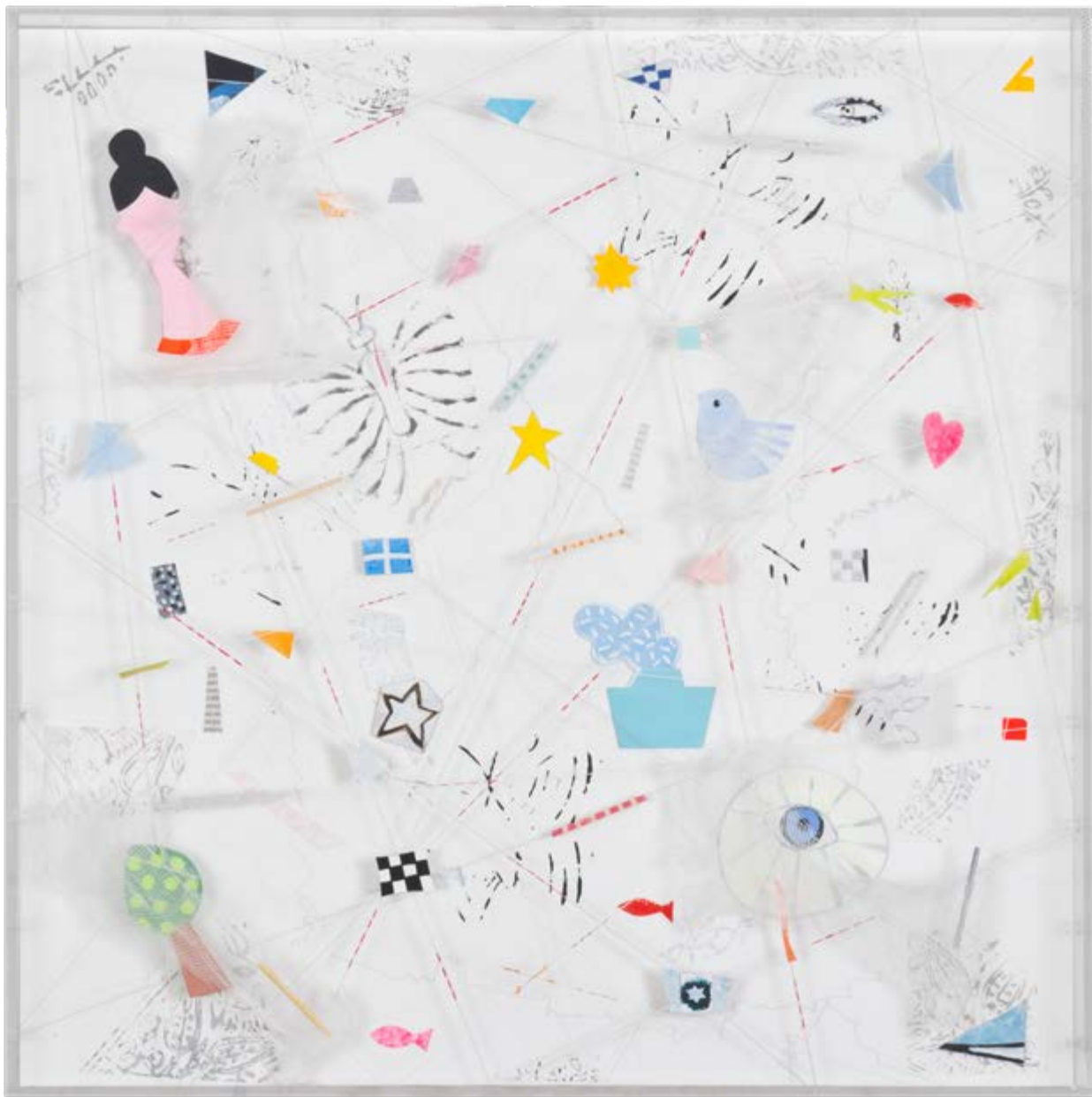
1. Fantasy, mixed media | 51x51 cm | 2017