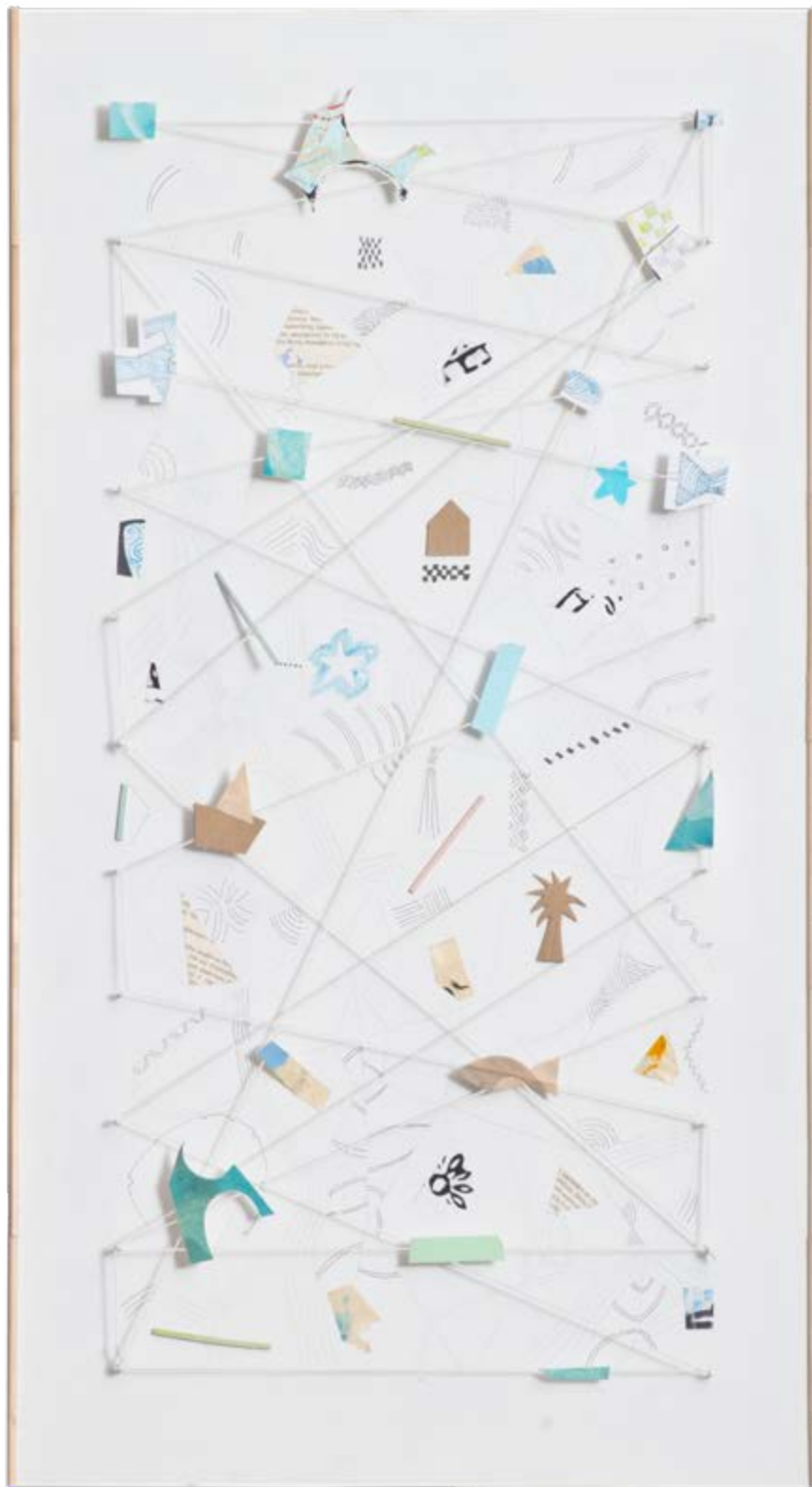
15. Summer games I, mixed media | 60x33 cm | 2018