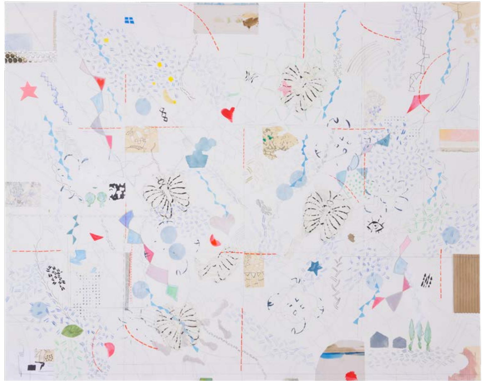
2. Butterflies, mixed media | 80x100 cm | 2017