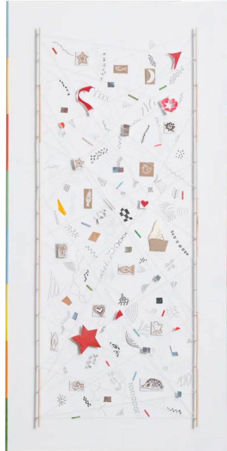
14. Match game II, mixed media | 80x40 cm | 2018