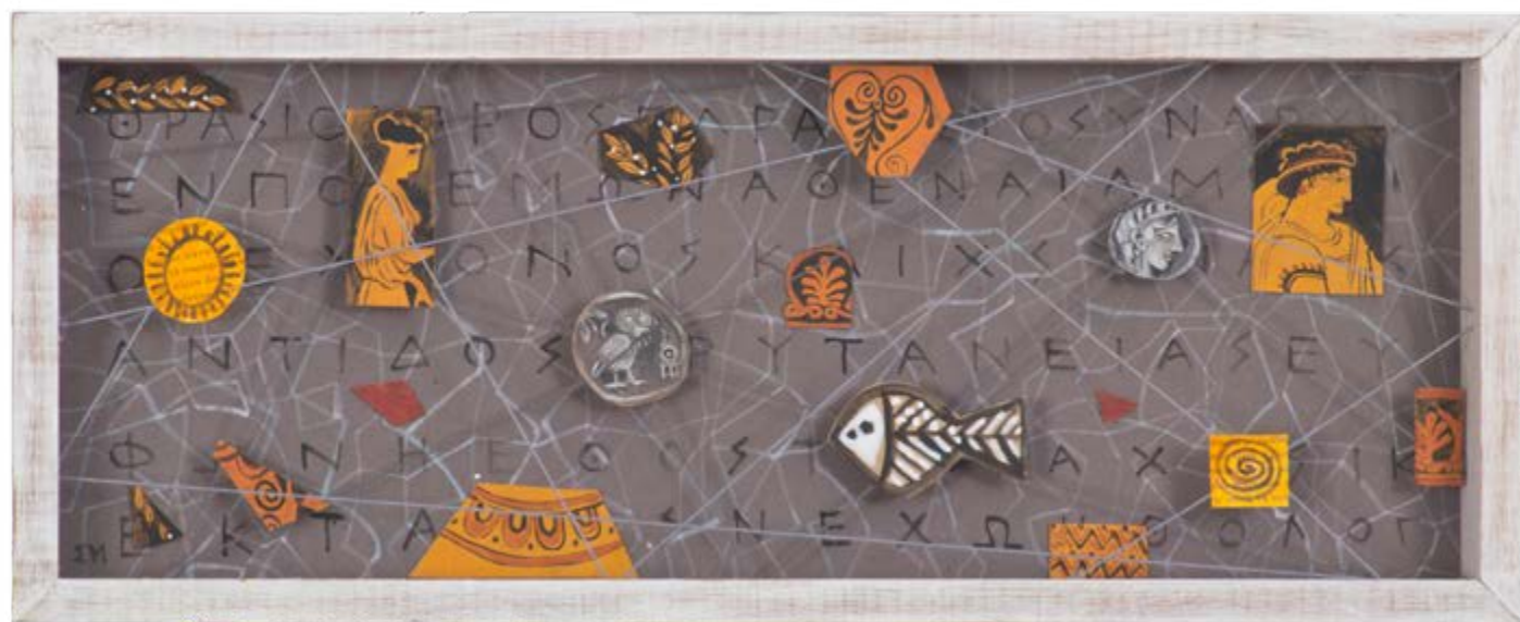
21. Archaic, mixed media | 20x50 cm | 2017