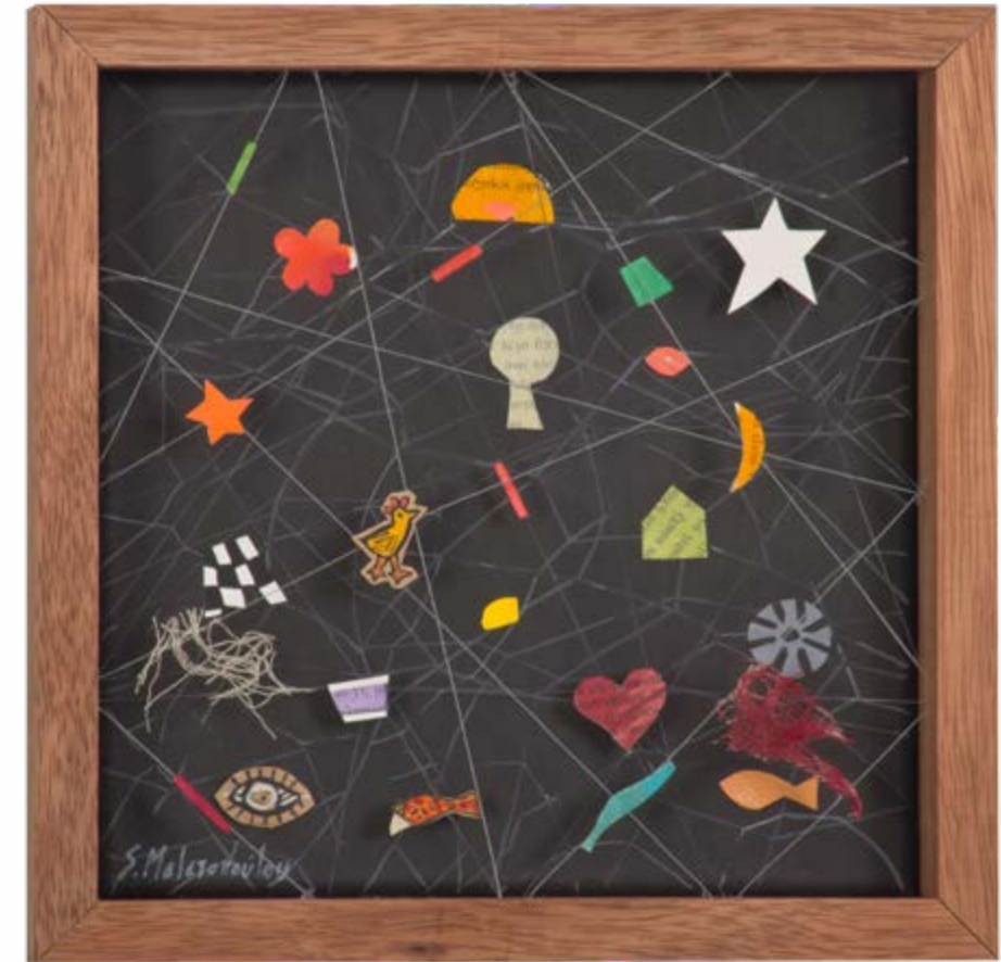
12. Mini box, mixed media | 23x23 cm | 2017