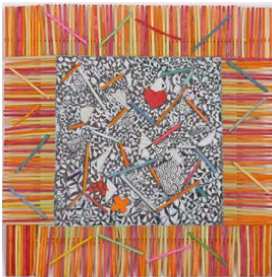
27. Tiny, mixed media | 26x26 cm | 2017