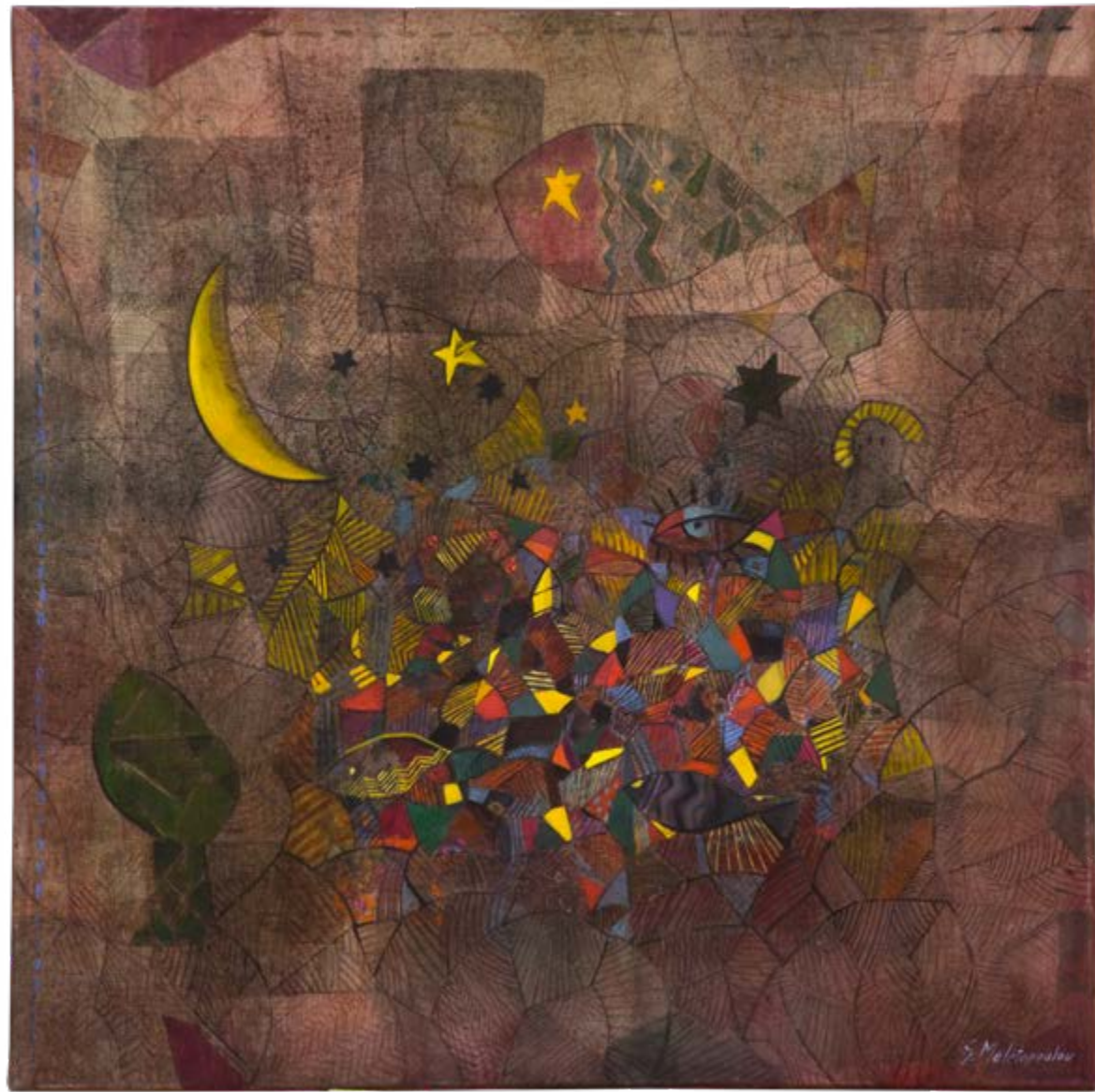
25. Nocturne, mixed media | 50x50 cm | 2017