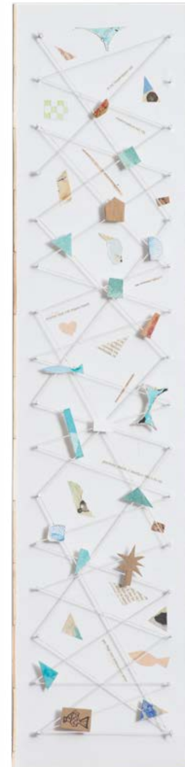
16. Summer games II, mixed media | 60x14 cm | 2018