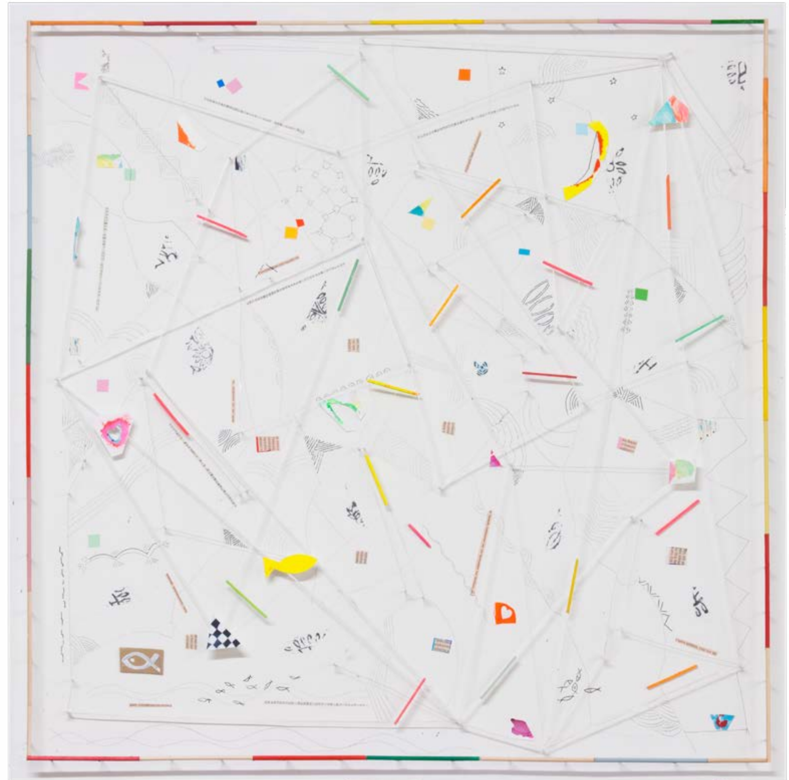
7. Game of threads, mixed media | 66x66 cm | 2018