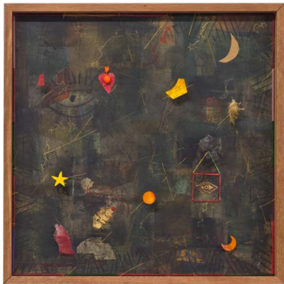
22. Magic box, mixed media | 53x53 cm | 2017